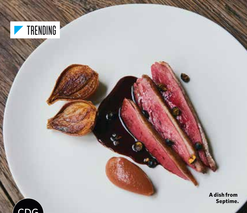
A dish from Septime.